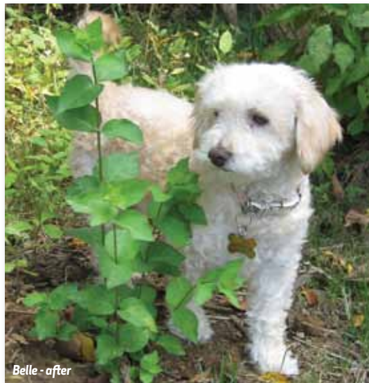
Belle - after