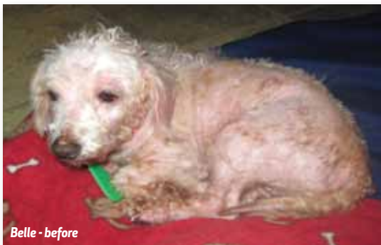
Belle - before