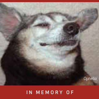
IN MEMORY OF

Tributes are a wonderful way to acknowledge the memory of a beloved person or pet as well as honor those who mean so much to you. Tribute forms can be printed from Stray Rescue's Web site - www.strayrescue.org and click on the 'How to Help' tab, then 'Donate to Stray Rescue' link.