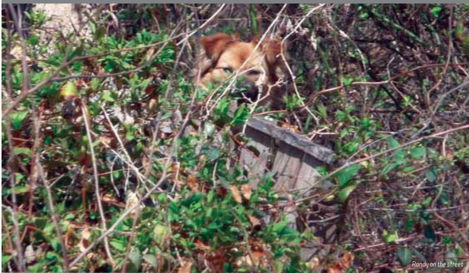
Randy on the street