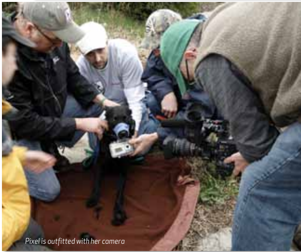
Pixel is outfitted with her camera