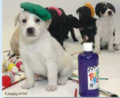
A puppy artist

Please mark your calendars on July 25 for our annual art show, Arf Nouveau at the 3rd Degree Glass Factory at 5200 Delmar, east of the University City loop. It is one of our most important fundraisers of the year and will feature the artwork of over 35 professional artists who create a piece of art in any medium that is inspired by a Stray Rescue dog or cat. In addition, over 30 Stray Rescue dogs and cats have created a special piece of art with their noses, feet and tails! For the first time, we will have a piece of art created by Clifton, a pot bellied pig that was rescued last year in the city.