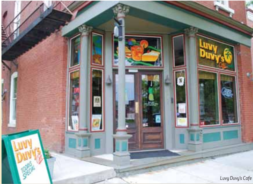
Luvy Duvy's Cafe

Even more special is the fact that both women have a long history of taking in stray dogs and cats and have lost track of the total number they have helped over the years. In fact, since opening Luvy Duvy's, they have rescued 10 to 15 dogs and cats that they found in Benton Park and found homes for all of them. Both feel their neighbors are "awesome" because so many took in one of their rescues. On a few occasions, Stray Rescue has been able to take a few dogs that they found, including a pregnant stray that was named Luvy Duvy in honor of them! All the dogs and cats