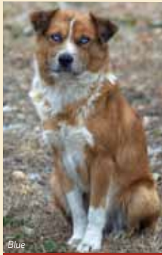
IN HONOR OF