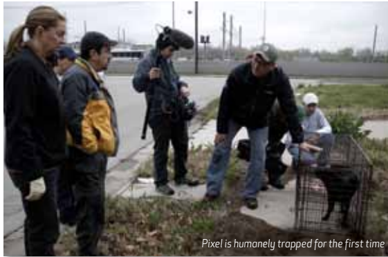
Pixel is humanely trapped for the first time