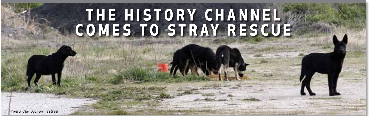
Pixel and her pack on the street